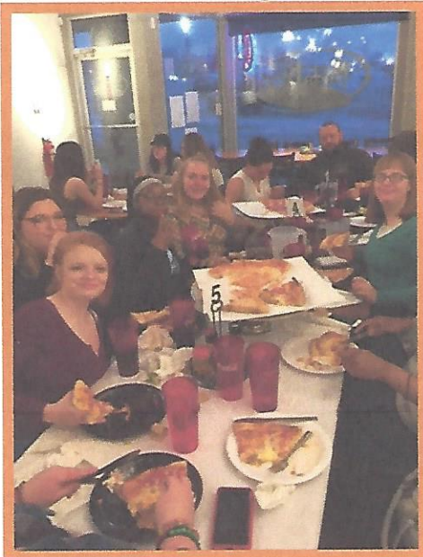
Teens On The Rise group enjoying the end of session pizza night at Bada Bing Pizza in Springfield, March 21 st

Each spring, the United Way sponsors an event which brings hundreds of local organizations together to serve the community. Students and volunteers gather together on United Service Day to work on improving the area. Catholic Central Day of Service students picked On The Rise as one of the twelve sites they would help in 2018. The students worked at the farm and built new raised beds for the vegetables. They delivered mulch, painted the gazebo area and picnic tables, and spruced up the farm after the long winter had taken its toll. The students were all great to work with and they accomplished some difficult, time-consuming chores. The On The Rise staff would like to give a shout out to the United Way and to the Catholic Central students (shown above). Great work!